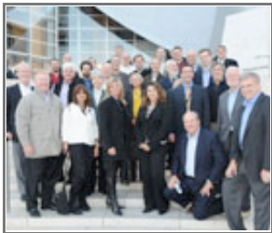
The DPAC Board and Design team in front of the Walt Disney Concert Hall in Los Angeles

Between December 2007 and February 2008, members of DPAC's Design Team, board of directors, city officials, and avid supporters toured some of the most prominent performing arts centers in Arizona, California, New York, New Jersey and South Florida in an initiative to identify design elements for DPAC's consideration. The tours included the Barton Myers-designed Tempe and New Jersey Performing Arts Centers, LA Music Center, Kodak Theater, Lincoln Center, Arsht Center and New World Symphony.